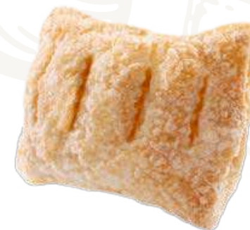
Guava & Cheese Strudel